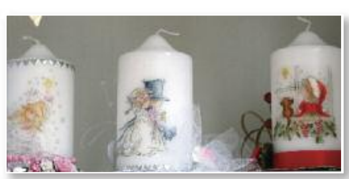
Off-the-page inspiration using a selection of LOTV stamps

Turn the page to see card inspiration using LOTV stamps